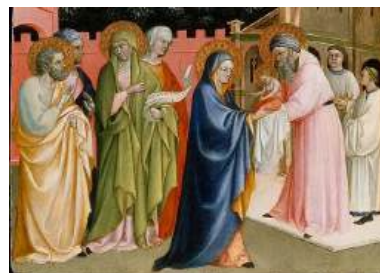
The Presentation of Christ in the Temple

https://thehub.leicester.anglican.org/learning-resources/storytelling-for-everyone/