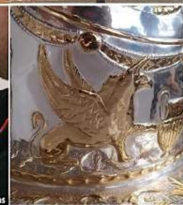
Leicestershire County Council Museums